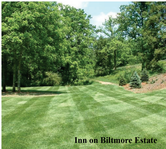
Inn on Biltmore Estate

High Compressive Strength CEC 26.9 me/100g increases filtration & nutrient retention